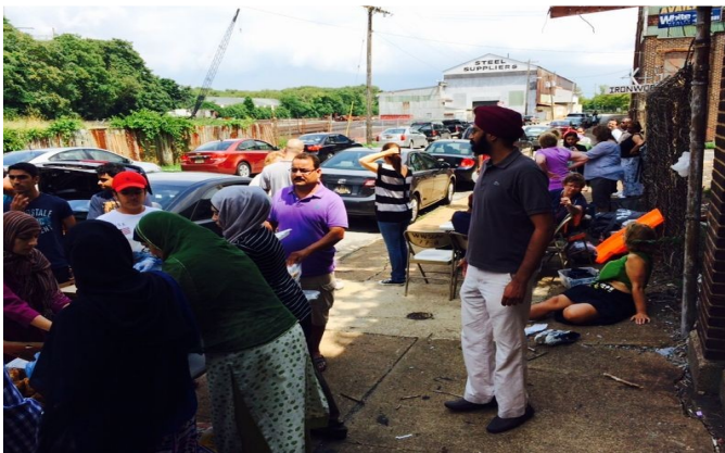
Qualifiers volunteering at "Giving Back to the Community Efforts"